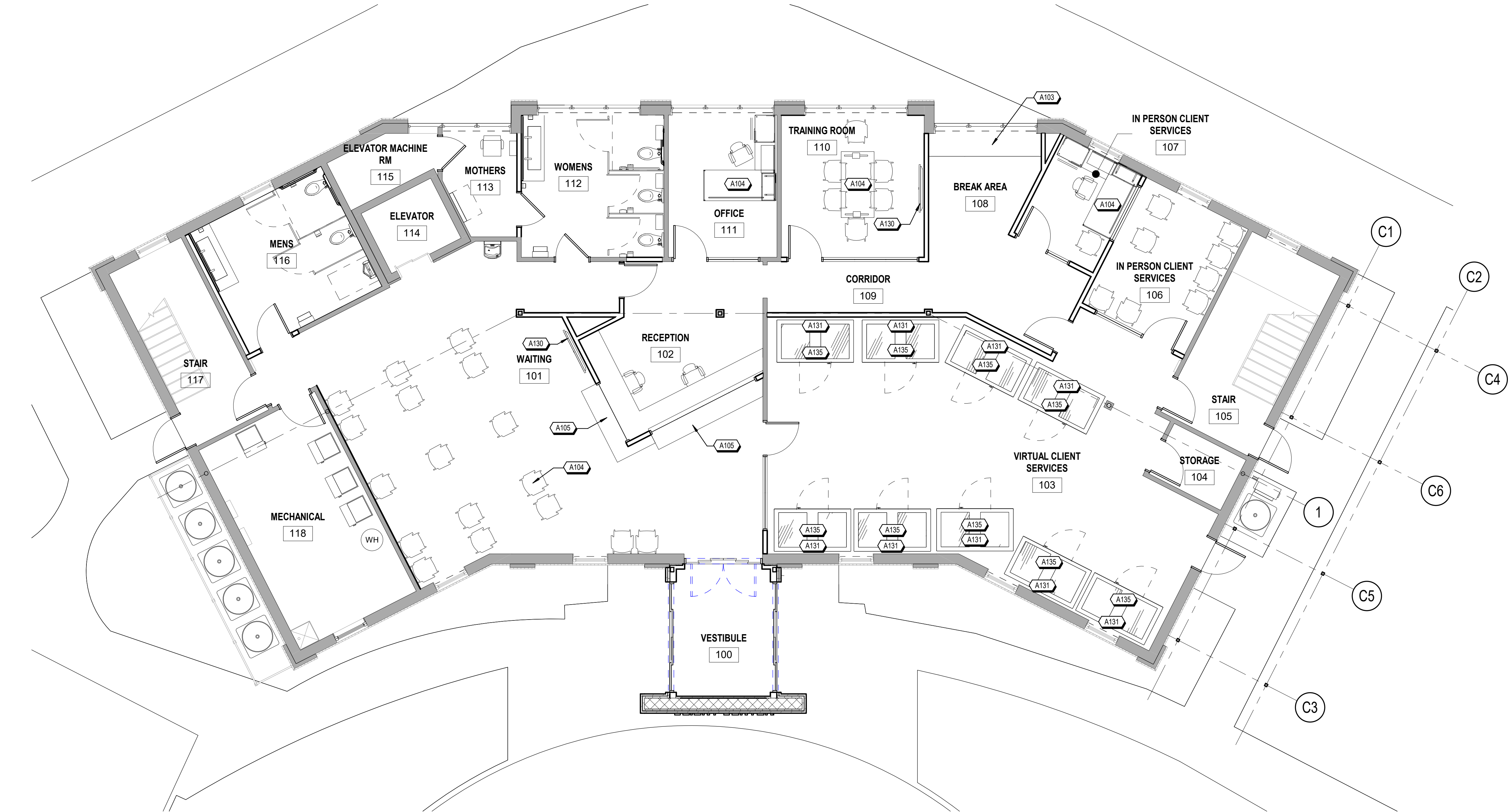
1 FLOOR PLAN - MAIN LEVEL 3/16" = 1'-0"